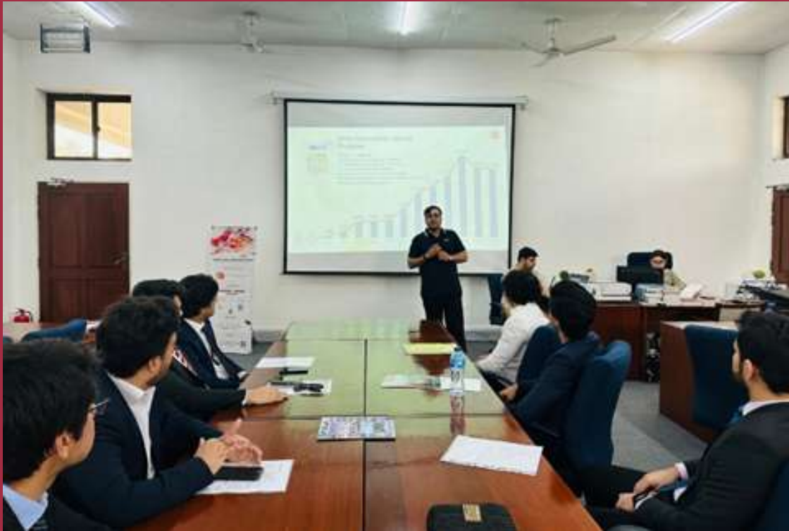
Xiaomi conducted the Recruitment Drive and on-spot interviews for Bachelor's and MBA 2024 students.